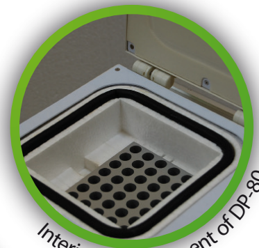
Interior compartment of DP-80