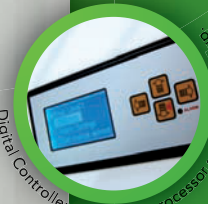
Digital Controller with micro processor and battery