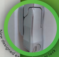
New designed easy to use Door lock