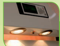
Halogen lights activate when door is opened.

We reserve the right to change specifications without notice. Subject to confirmation and availability.