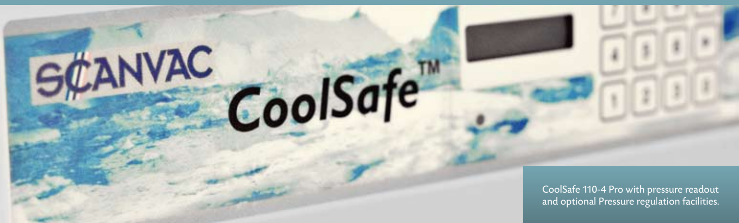
CoolSafe 110-4 Pro with pressure readout and optional Pressure regulation facilities.