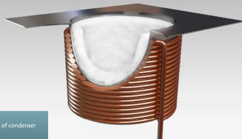
Seamless condenser and cooling coil outside of condenser for best trapping performance at -110^{\circ}\text{C} .