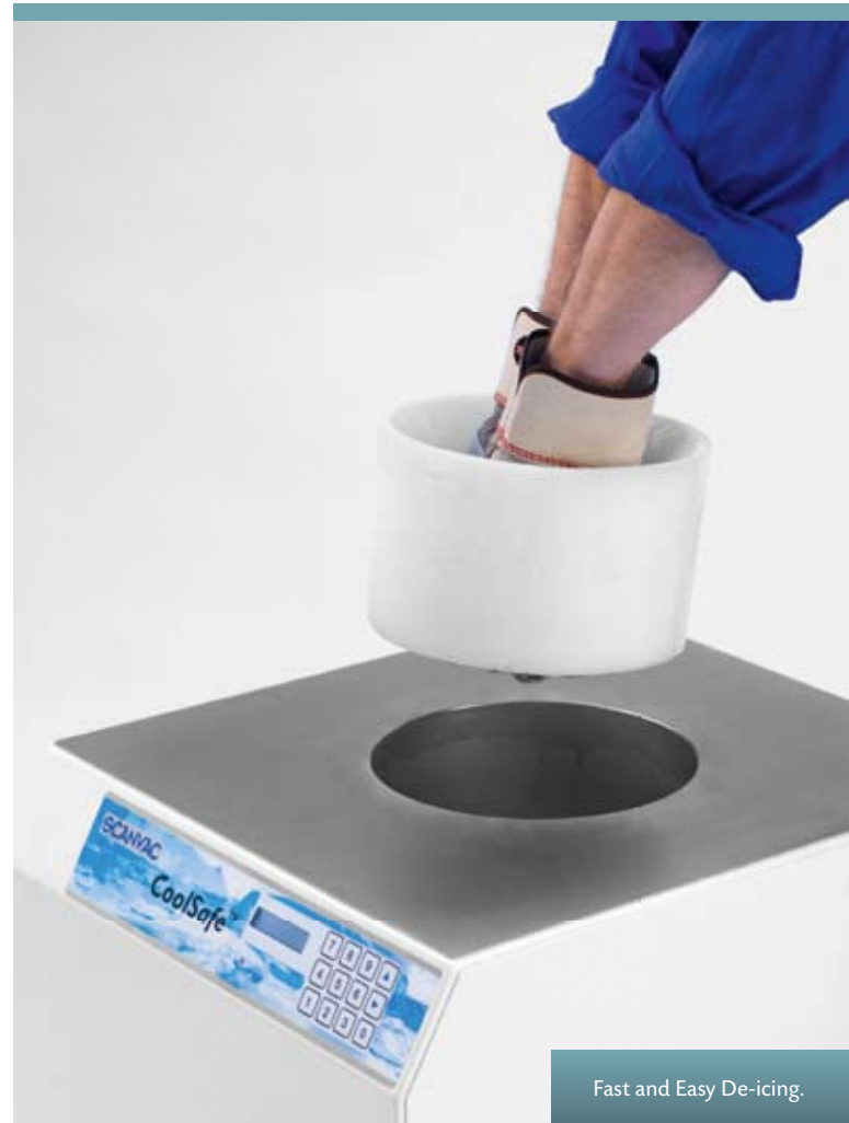
Fast and Easy De-icing.

If electrical de-icing is a requirement, this is available as an option. At the press of a button, the condenser wall is gently warmed and releases the "ice core" which can then be removed, condenser wiped dry and its ready for operation.