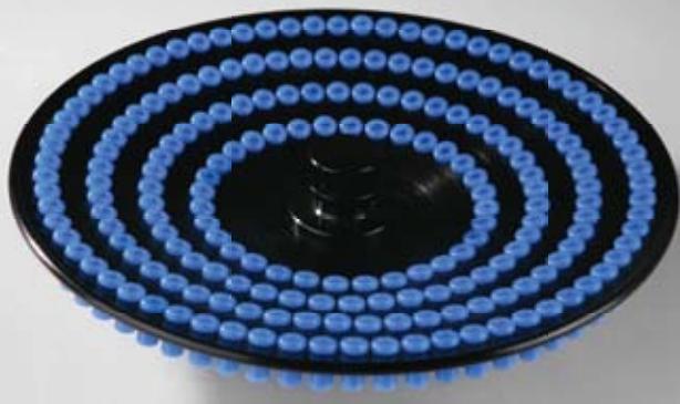
Rotor for 1.5-2.0 mL Eppendorf tubes.