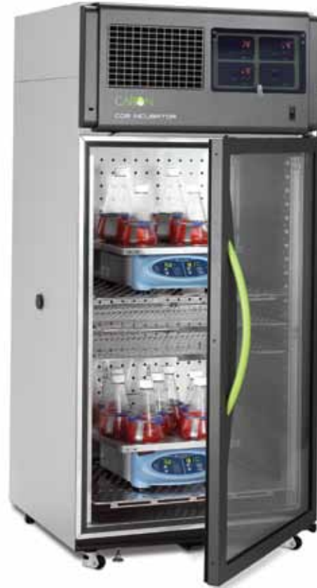
25 cu. ft. Model 6026 shown with shakers and optional accessory SHKR301, two-tier Shaker Support System.