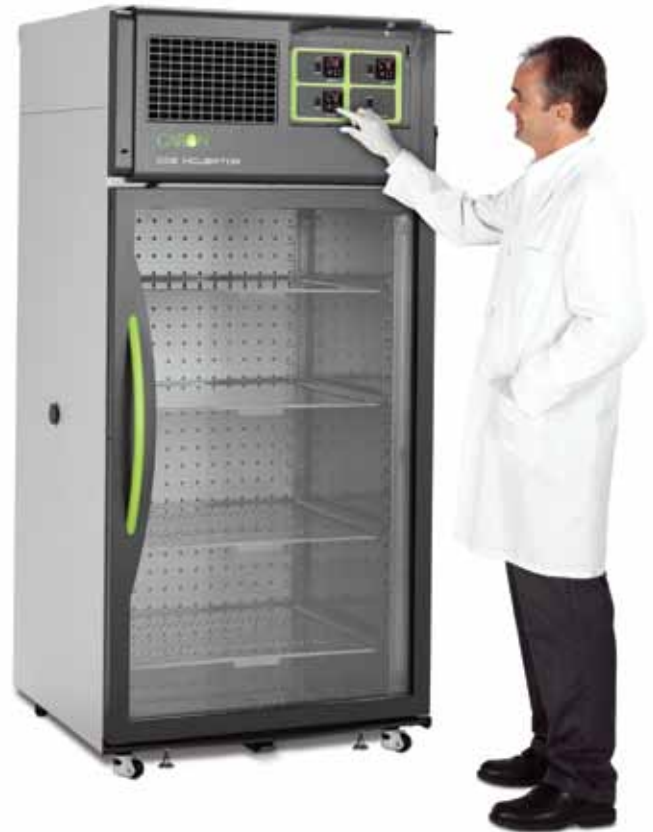
Model 6024 shown with standard shelving.

This new feature occurs at the end of the decon cycle and pumps HEPA filtered air into the incubator. The result is a clean, dry incubator with no additional clean up required! The drying cycle quickly cools the incubator in the final phase of the maintenance free, overnight decon cycle.