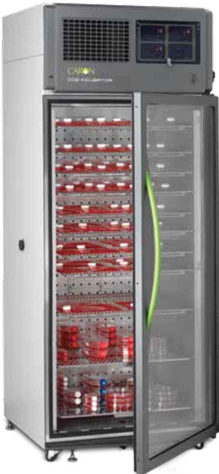
Model 6044, 33 cu. ft. unit shown with extra shelving.

CONTROLLED HUMIDITY AND IR SENSOR PROVIDE PRECISE CONDITIONS